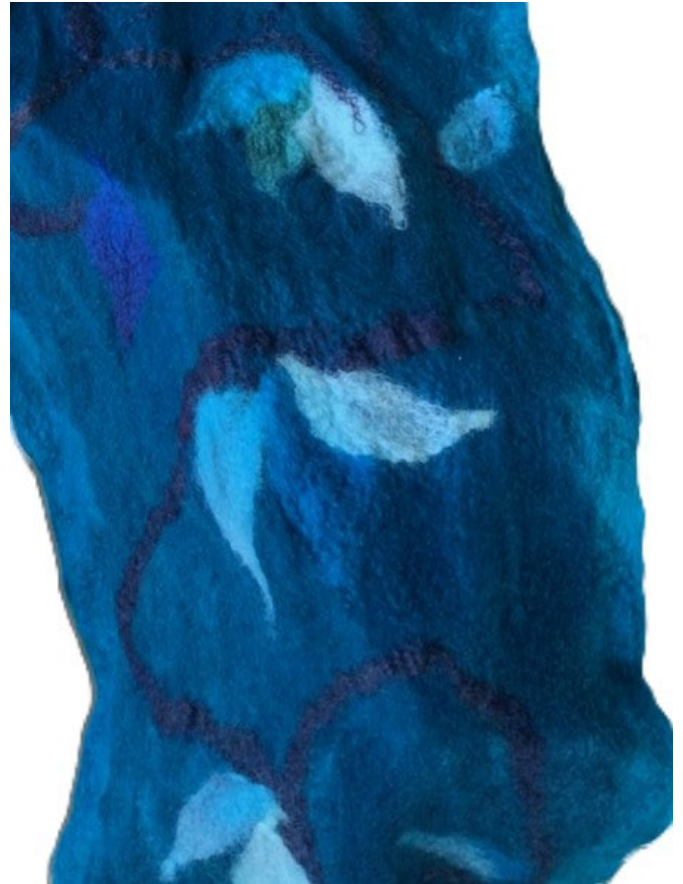
Close-up detail of the scarf used to demonstrate the Gentle Roller, now drying at home.