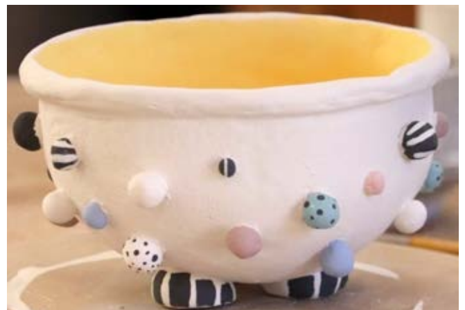
A finished piece