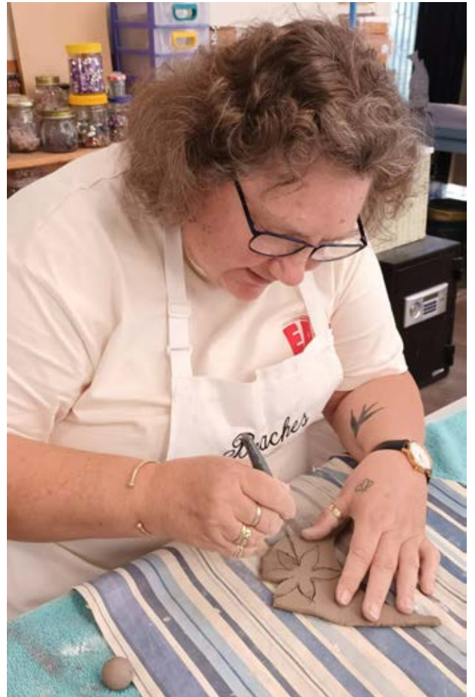
Ladies working on design, looking forward to seeing the finished product.