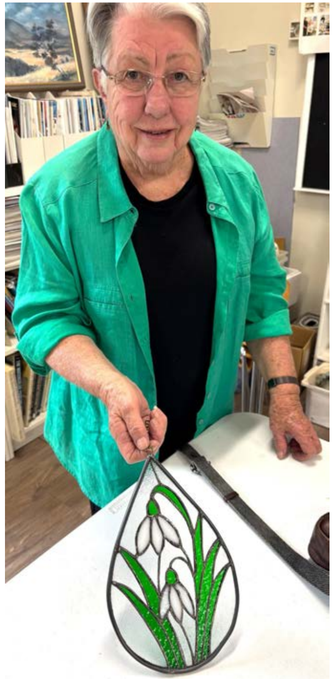
Wendy's beautiful suncatcher.

The Leadlight group has been busy working on various projects.