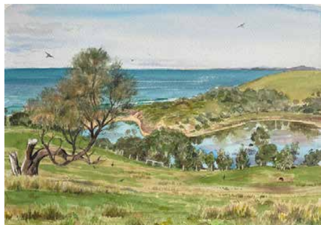
The Tilba Cemetery and nearby farmland