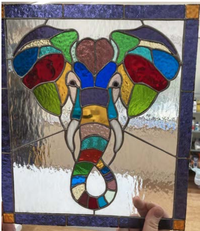
Donna's magnificent foiled Elephant wall hanging!

The Leadlight group continue to meet every second Monday at the Glasshouse Rocks Rd studio with lots of interesting projects underway.