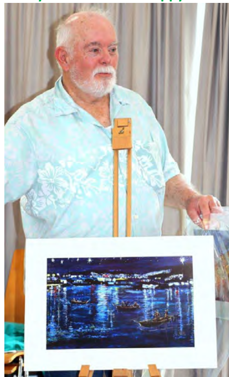
(Thanks Rosy for this editorial).