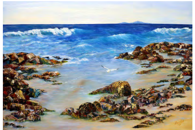
Thursdays – Oils and Acrylics with Cheryl Hill 1:30 to 3:30 pm Resumes Monday 16 January 24