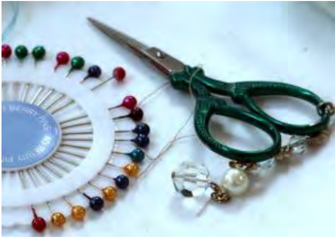
Bring your material, needles, etc.