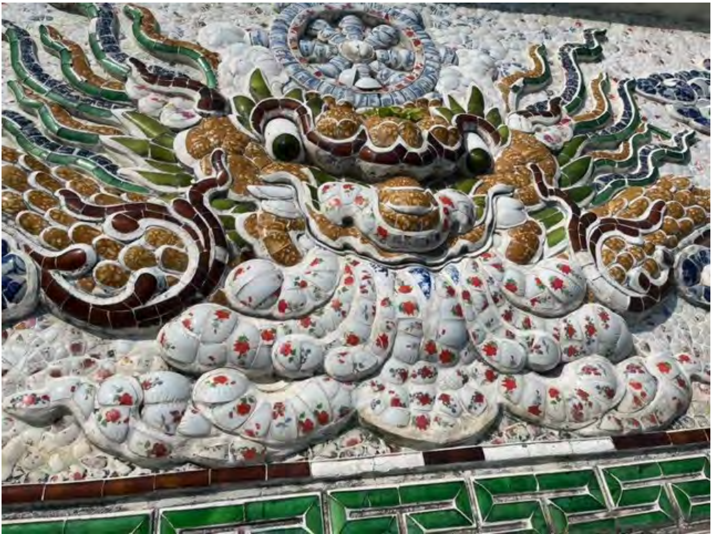
Enlargement of mosaic dragon. It is all made from reused pottery and ceramics you can see the shape of the cups.