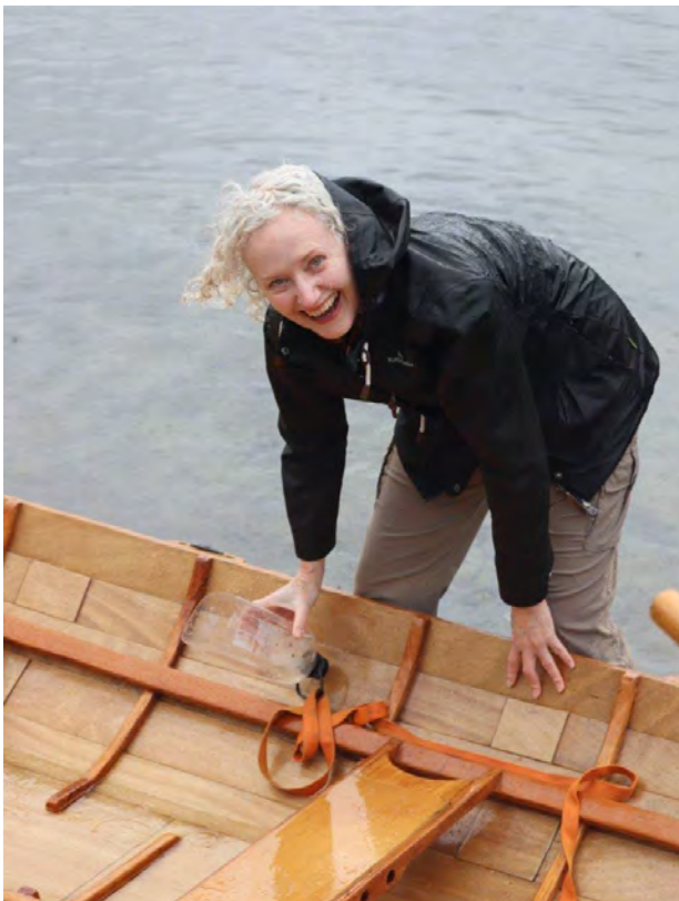
Boating in the Rain, still looks like fun