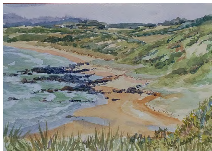
Watercolour painting from plein air at 1080 Beach.