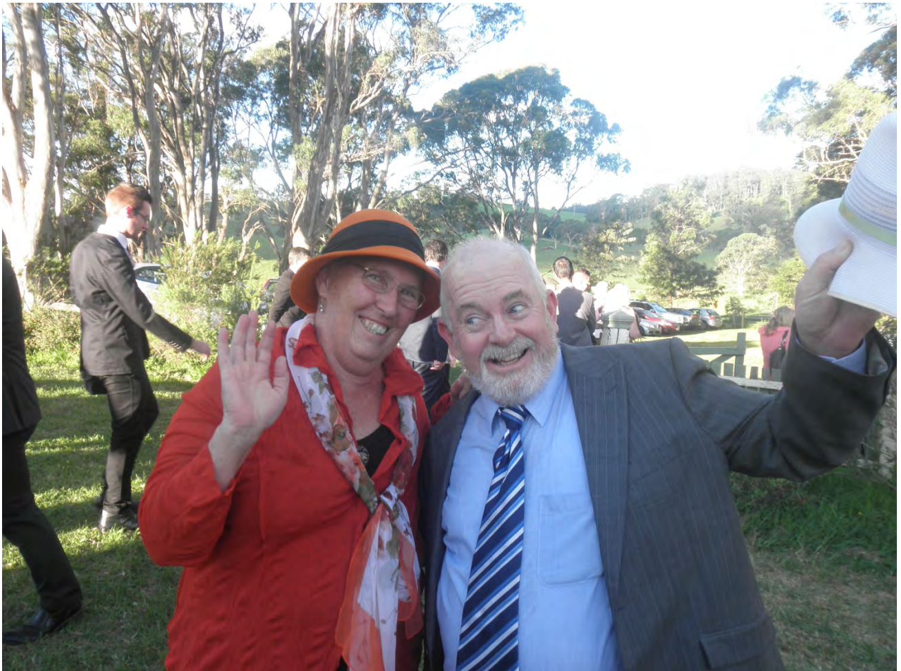
Two happy artists pictured at Tilba Tilba,